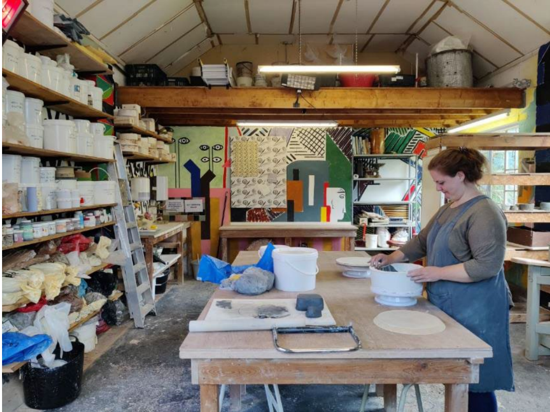
Wysing Ceramic Studio Open Morning, 2022.