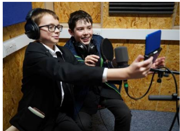
Young people working in Wysing's Ceramics Studio and Recording Studio 2021.