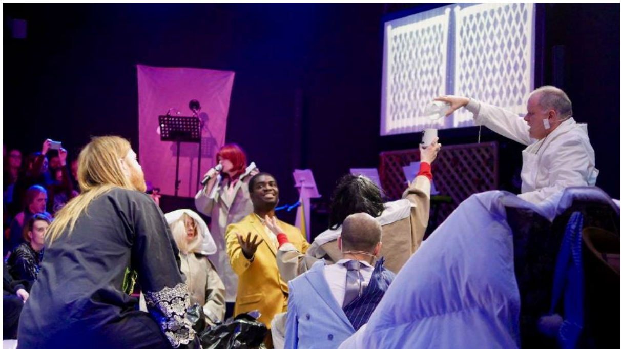
Ravioli Me Away, The View From Behind The Futuristic Rose Trellis , 2019. Photograph: Jay Parekh