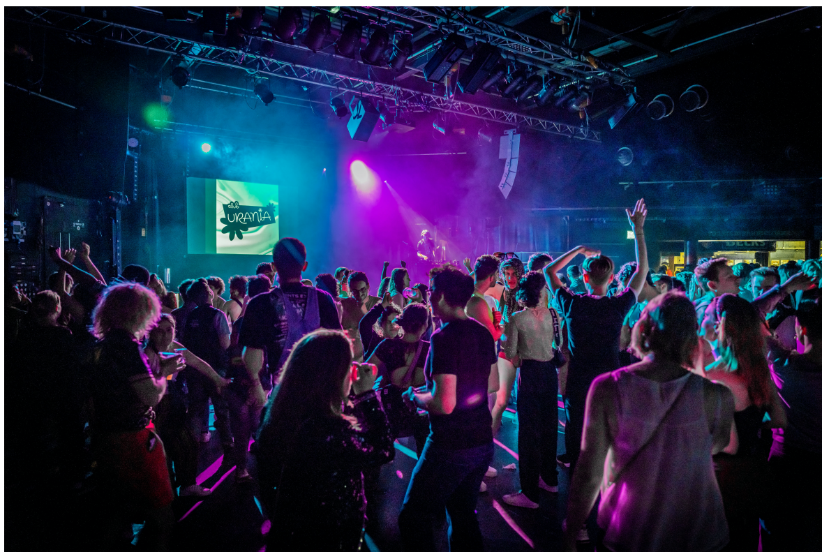
Club Urania, Wysing Arts Centre and Cambridge Junction's LGBTQ+ club night, 2022.