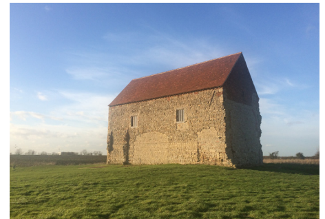
Clockwise from top left: abandoned Tesco store, Cambridgeshire; Dead oak trees in Mundon, Essex. Chapel of St Peter-On-The-Wall, Bradwell-on-Sea; Pontins Holiday Park, Norfolk

The East Contemporary Visual Arts Network (ECVAN) is delighted to announce the launch of New Geographies, a three-year Arts Council England-funded project that invites members of the public to nominate locations for 10 major site-specific visual arts commissions across the East of England.