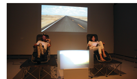
Left and Above: Futurecamp: Private vs Public and The Way We Live Now.