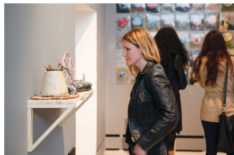
Above: Annals of the Twenty Ninth Century , installation view. Below: Hey, I'm Mr Poetic , installation view.