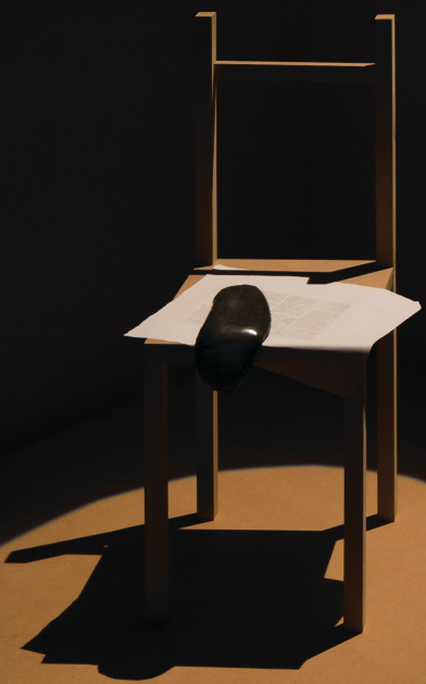
Cover: Annals of the Twentieth Ninth Century; Installation view; Photo: Plastiques Photography. Left: The Influence of Furniture on Love. Photo: Paul Allitt / Far right: Leverhulme Arts Scholars 2014. Photo: Bryony Graham

DURING 2014 WYSING CELEBRATED 25 YEARS AS ONE OF THE UK'S MOST PROGRESSIVE ARTS ORGANISATIONS; DEVELOPING NEW WAYS TO SUPPORT ARTISTS, AND ENABLING ART AND IDEAS TO REACH A WIDE RANGE OF PEOPLE IN UNEXPECTED WAYS.