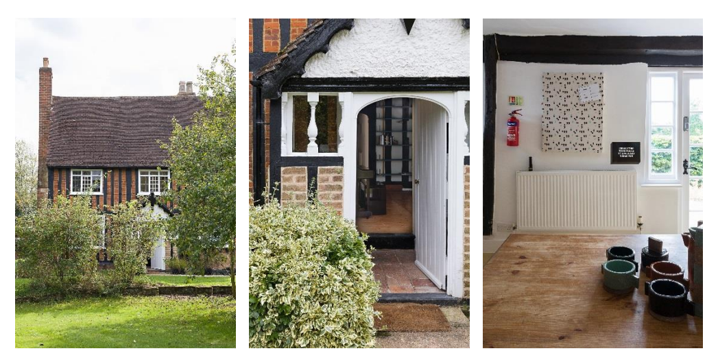
WYSING POLYPHONIC STUDIO & WYSING GRANGE FARMHOUSE