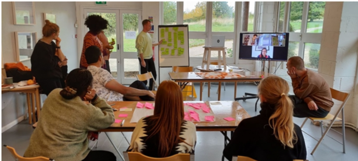
Syllabus VI at Wysing, September 2020

During periods between the gatherings, an online programme will maintain contact between artists, and the Artist Advisor will support and advise participating artists through a series of planning sessions and 1-2-1 conversations.