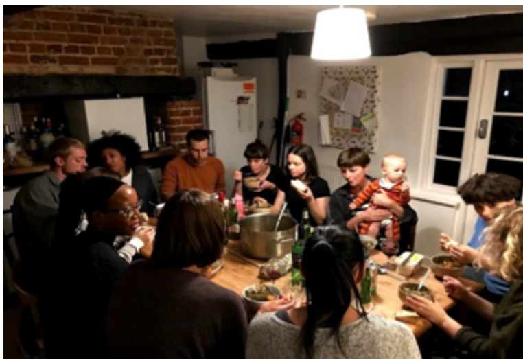
Syllabus IV at Wysing, September 2018

Online Programme , convened by Spike Island