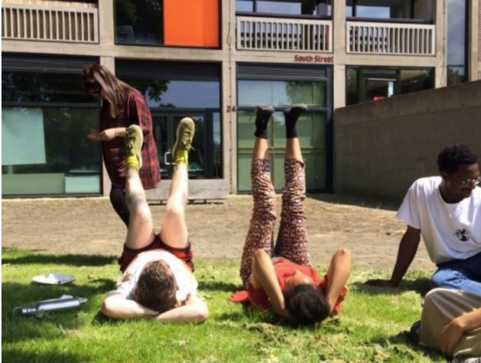
Syllabus III at S1 Artspace, 2018