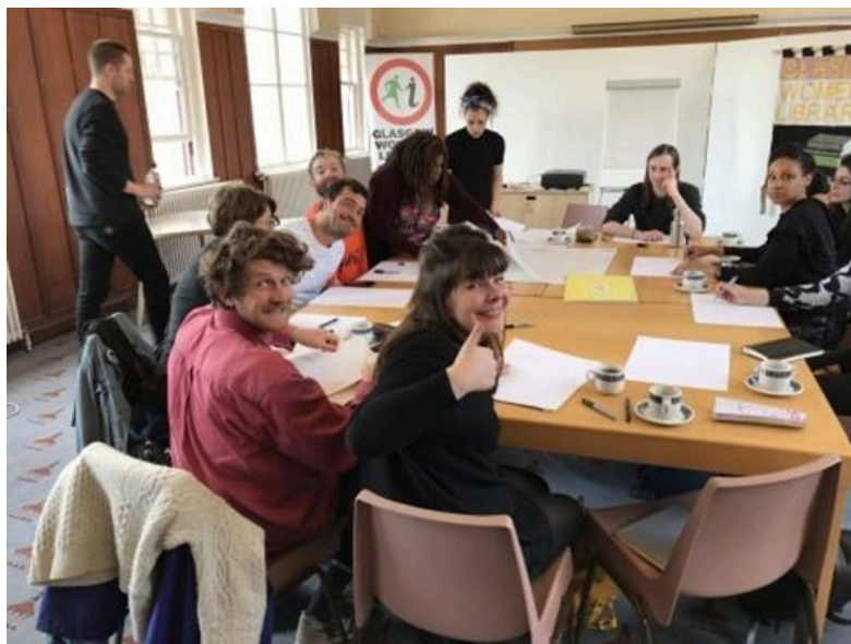
Syllabus III visiting Glasgow International with Studio Voltaire