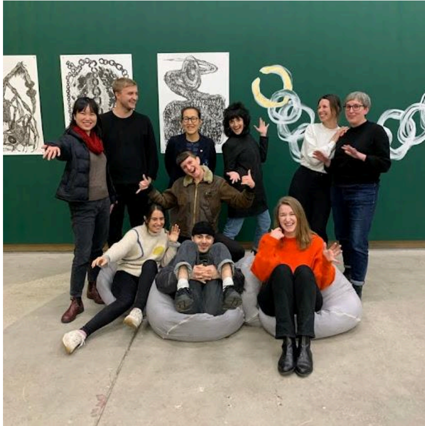
Syllabus V at Eastside Projects