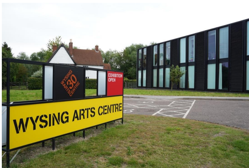
Wysing's entrance sign