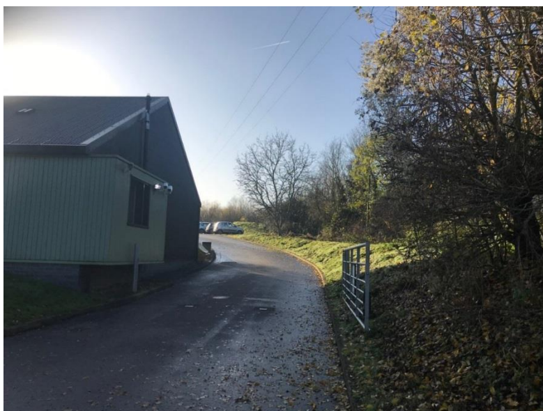
Entrance to general car park