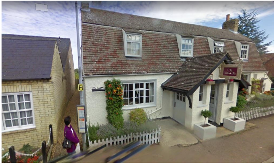
Bus stop in Bourn

From Cambridge Bus Station on Drummer Street, take the No 18 from Bay 5 (above photo). The bus company is Stagecoach.