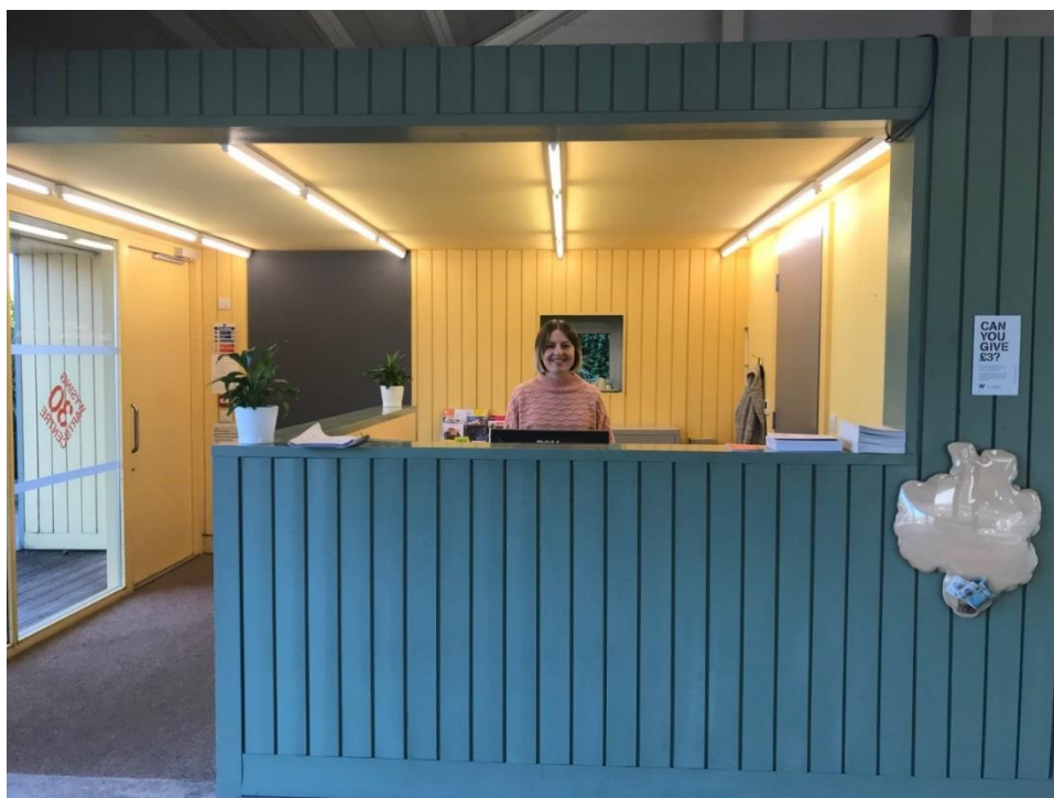
Reception desk and happy Receptionist