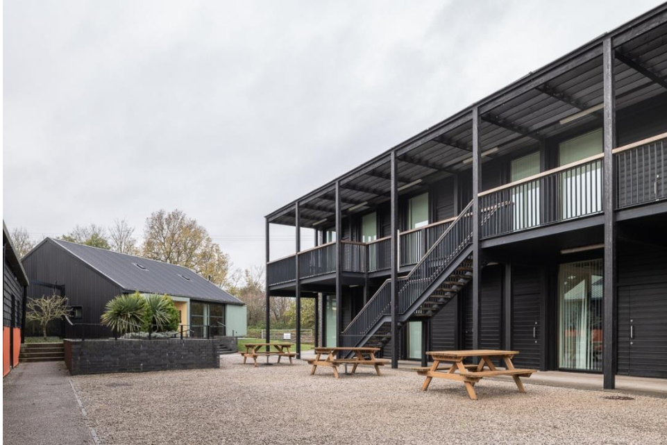
Courtyard and main studio building

area. The studio benefits from ample natural light, underfloor heating and ample parking nearby. It is located in our main studio building.