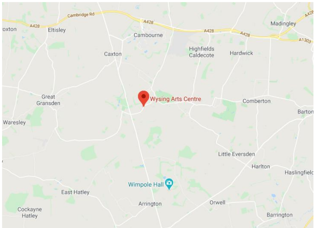
Wysing Arts Centre location on Google Maps

Wysing Arts Centre is located outside the village of Bourn, nine miles west of Cambridge.