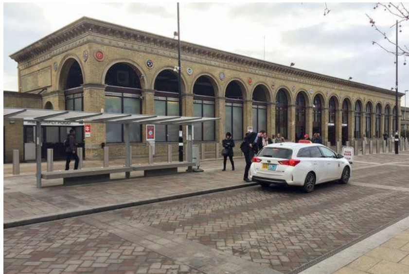
Cambridge train station and taxi rank