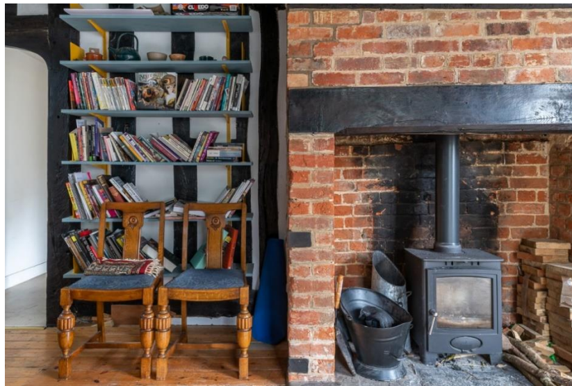
Library and fireplace in the farmhouse

works from previous residencies, a library with books donated by artists who stay with us and a wood burning stove in the lounge.