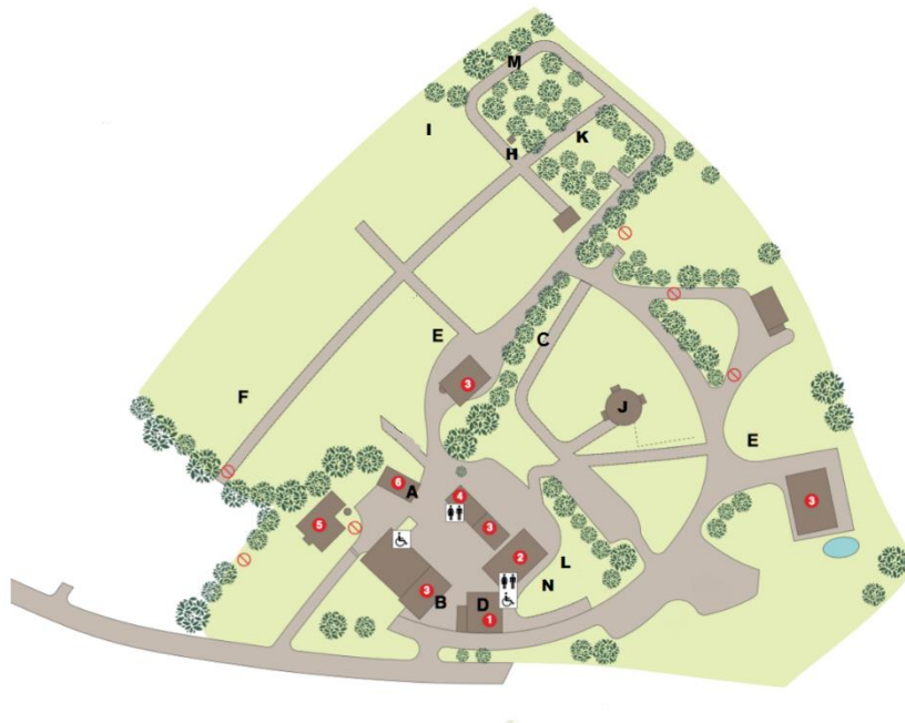
Wysing Site Map

Some of the natural grounds are uneven, so care must be taken when navigating across the site. If you are staying with us, you will be given a short tour and a guide to where everything is located.