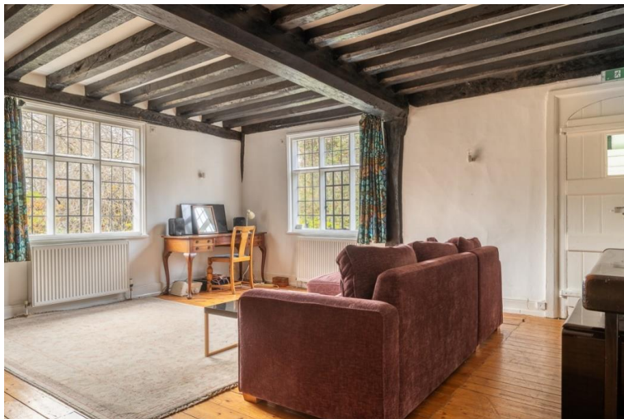
Farmhouse sitting room

Our 17th century farmhouse comfortably sleeps up to 10 people. It has a large kitchen and lounge area and two bathrooms both with showers and one with a bath. The kitchen has a dishwasher, washing machine, tumble dryer, fridge and tabletop freezer. The decoration includes art